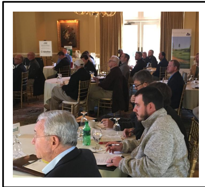
Esteemed Members & Guests TCNC