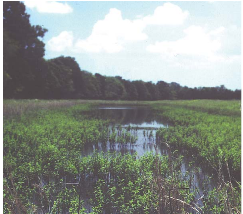
A neglected pond in need of substantial rejuvenation.

There are a number of things that can be done to maintain the structural condition of the pond dam, banks and spillway.