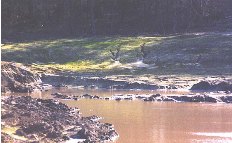
Ponds constructed in sandy soil often develop extensive leaks.

Well constructed anti-seep collars installed on all pipes as they are placed in the pond dam will prevent leaks from occurring along drain surfaces. Repair leaks from the inside of the pond. It may be necessary to drain some or all of the water out of the pond depending on the position of the pipe. Remove soil from around the pipe for about 4-6 feet. Install an anti-seep collar if possible. Refill the exposed area with clay or a mixture clay and bentonite, or clay and cement.