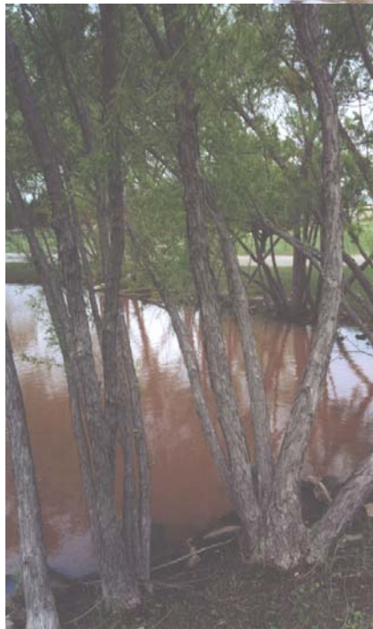
Trees on pond dam.

Trees that are rooted in ponds can remove large amounts of water through the roots and out into the atmosphere through pores in leaves in a biological process called transpiration. The rate of transpiration increases with temperature, wind and dry air masses; conditions that are associated with summer drought. Pond water loss can be significant and noticeable from transpiration during periods of hot summer weather. Trees can remove as much as 50 gallons of water per day from the pond. It may be beneficial to remove trees that are directly along the shoreline in ponds subject to severe fluctuations during period of drought. See the section “Conserving Water In Ponds” for more information on measures that can be taken to conserve water.