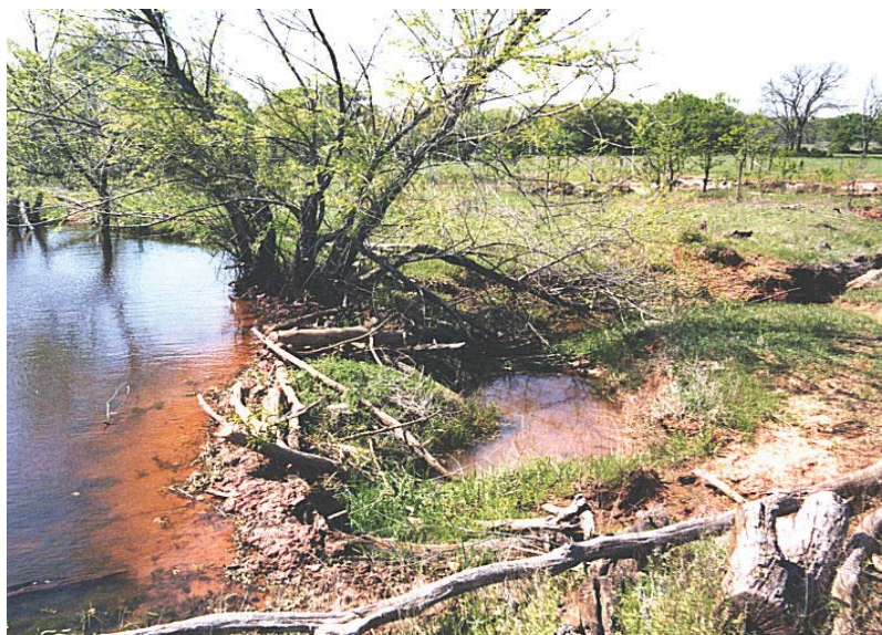
Livestock eroded trail and beaver dam located in the emergency spillway.

Beavers feed on a variety of vegetation and may enter agricultural fields to feed on corn, soybeans and other crops. Tree bark also is an important food source. To control beaver populations eliminate