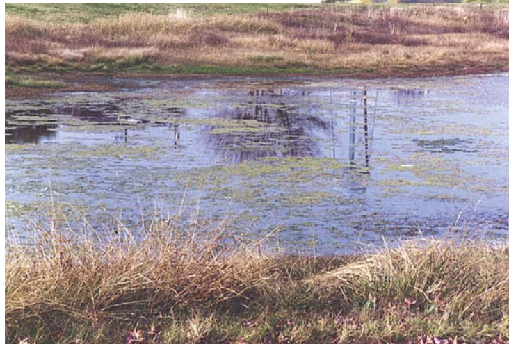
Algae choked pond.

Old ponds may be shallow because leaves, aquatic vegetation and eroded soil have accumulated in the pond for many years.