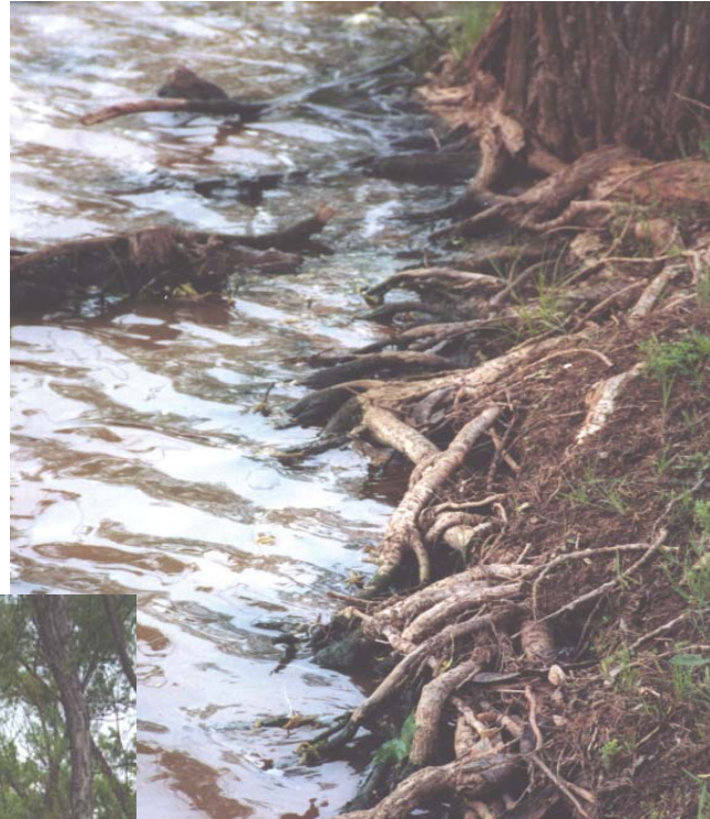
Willow roots degrading pond dam.

necessary to maintaining the structural integrity of the pond dam. Bare, earthen spillways, often the result of cattle paths, can rapidly erode during heavy rain events. Erosion eventually cuts a path through the pond dam, drains the pond and floods areas below the dam. A properly constructed emergency spillway will help prevent erosion problems. The emergency spillway should be gently sloped and covered in dense grass. Spillway size is dependent on pond size, watershed and precipitation patterns. Bermuda grass is most often used in Oklahoma as a spillway and pond bank