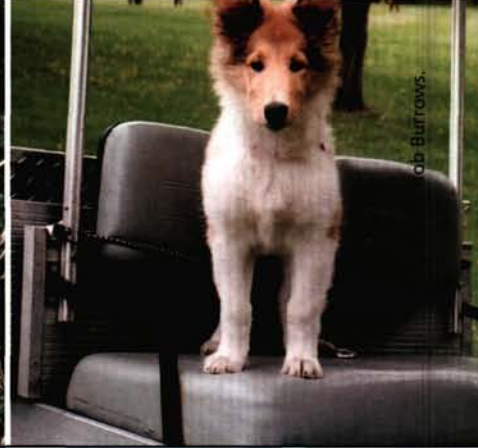
Skyler has become an informal mascot at Rosedale Golf Club.