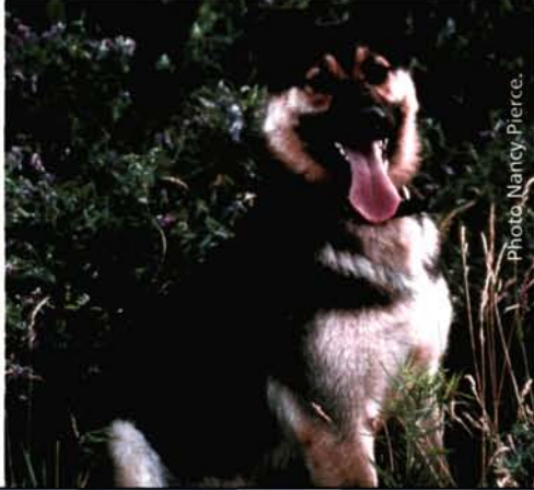
Sullivan is the environmental watchdog at The Links at Crowbush Cove.