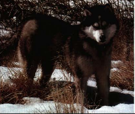
Huskies like Wascana Country Club's Sheena thrive at being kept busy.