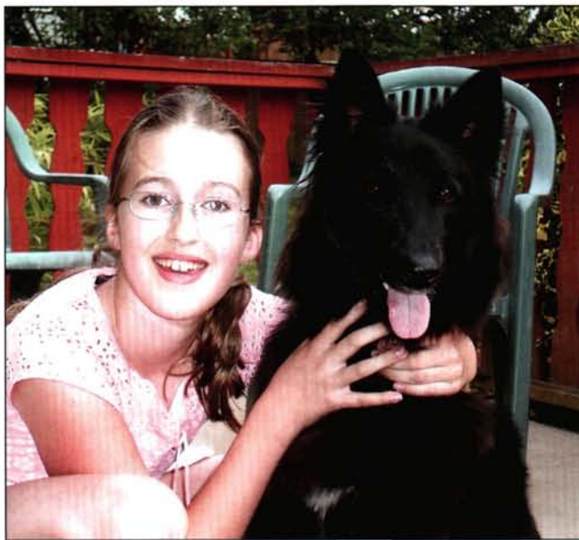
Divot receives unconditional love and adoration from both staff and family members at the Victoria Golf Club.